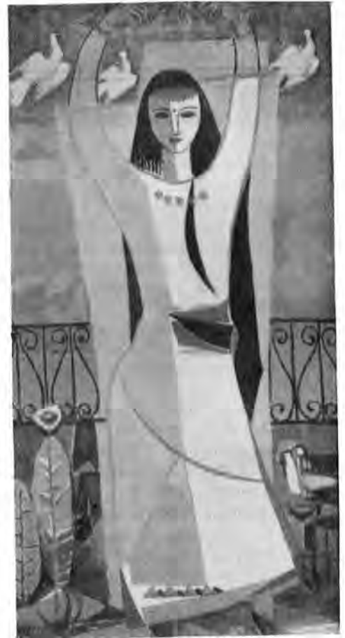
Invitation to Happiness

A sketch by Hamid Attar is like a short lyrical poem: a baby is lying fast asleep, with a dove and an olive-branch