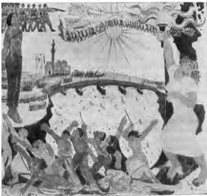
The Fight at the Bridge (The Bagdad Demonstration of 1948)

Peking's people, who turned out in their hundreds of thousands to demonstrate their support for Iraq when the American and British imperialists threatened the new republic at its birth, have taken this exhibition to their heart. It has brought Iraq still nearer to them. It has made a good start in strengthening the cultural ties between the two countries.