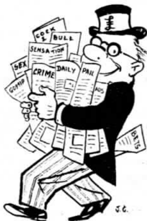
"I simply love newspapers."

This U.S. publicity hoax got its just deserts: smashed windows and signs drawn on the pavilion in Arabic and English reading: "Boycott American Chicken!"