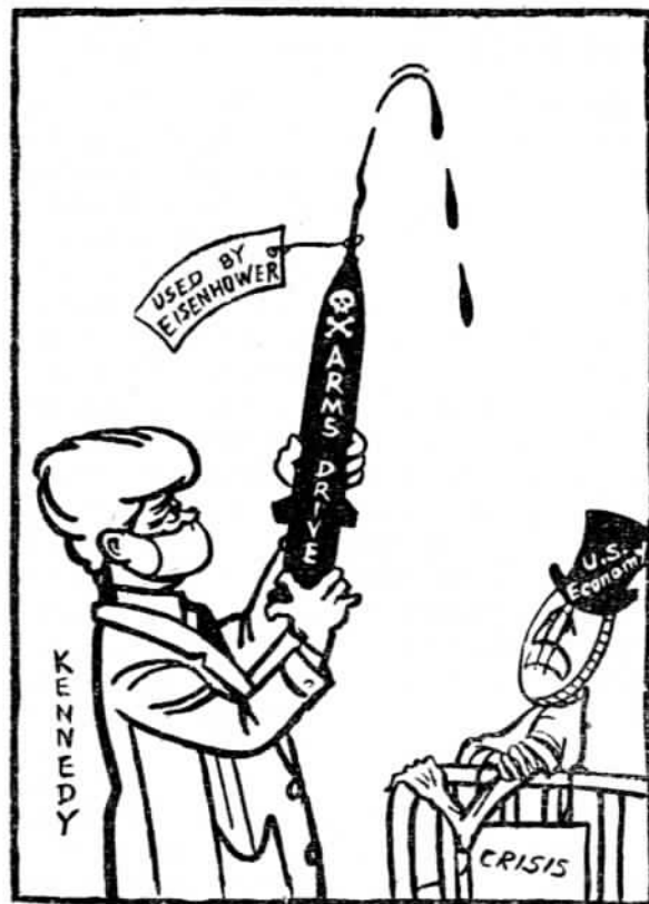
New Quack, Old Nostrum

Although at the present moment the Kennedy administration is devoting itself to gaining time, this does not signify that during this so-called "danger period," the United States will absolutely not embark on an adventure and launch an all-out nuclear war. The U.S. press has revealed that the new U.S. defence chiefs are every bit as eager as the old in studying pre-emptive strategy in a nuclear war. And the Pentagon has prepared a complete list of the targets for attack including military targets in the Soviet Union and its important cities. This is said to be the foundation of the Kennedy administration's operational plans. At the same time, the Pentagon is making active preparations to set up so-called Air and Sea Commands and is planning to merge the Strategic Army Corps