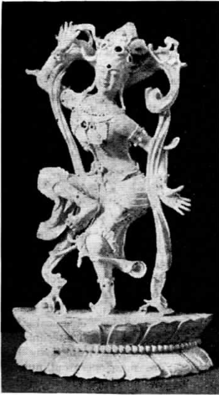
The Dancing Goddess