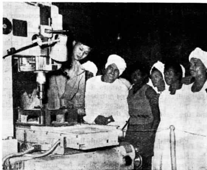
An on-the-spot demonstration in the Chinese exhibition in Khartoum

There were many requests for portraits of Chairman Mao Tse-tung and copies of his writings. His appearance