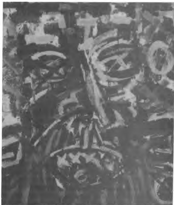
"Not Human" (second series).