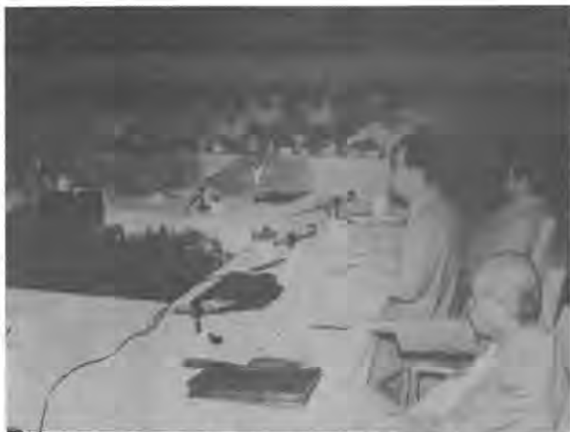
Li Peng addressing the June 13 meeting of Party and government leaders.

All in all, China will, as always, unswervingly carry on all the principles and policies that have been laid down since the Third Plenary Session of the 11th Party Central Committee held towards the end of 1978, and conscientiously sum up experiences so as to persist in the right and correct the wrong. Just as Deng Xiaoping said when he recently met army commanders and higher officers of the martial law enforcement troops in Beijing, the current counter-revolutionary revolt as a bad thing may enable us to carry on our economic reform and opening up with steadier, better and faster steps, to correct our errors more quickly and carry forward our strong points more surely. □