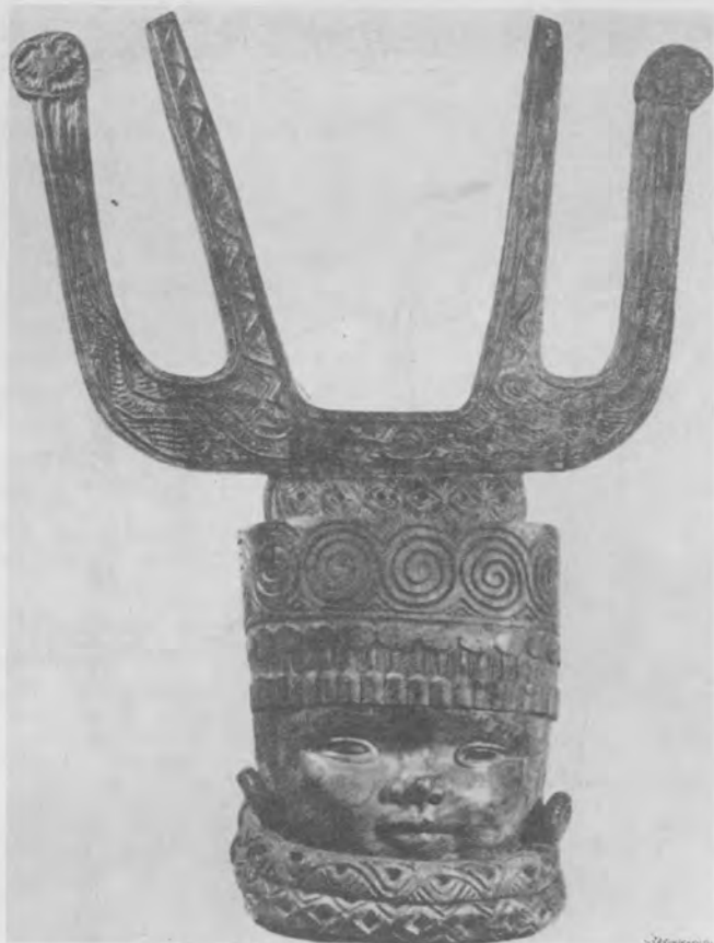
Child (wood sculpture).