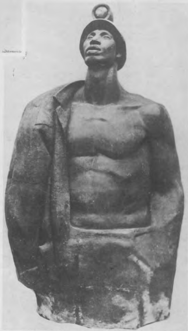
A Miner (pottery sculpture).