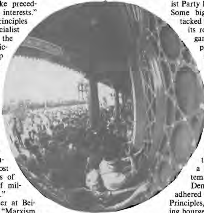
Zhongnanhai, seat of the Party and government headquarters, was besieged on May 17. XUE CHAO

garding the great achievements that ten years of reform have brought, slandered socialist China as being "black as pitch," "reaching a severe crisis," "rampant with profiteering officials, full of corruption and degeneration, and collapsing morally." They claimed