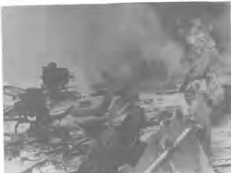
Dozens of armoured vehicles of the martial law enforcement troops were burned by rioters to the west of Muxidi on the morning of June 4.

Taking advantage of the mess, some rioters also smashed and destroyed civilian facilities. For example, they broke all the display windows of the Yanshan and other stores and set to fire the pine fences to the west of the Memorial Hall of Mao Zedong and destroyed and burned public buses, fire engines, ambulances and taxis. What was most ruthless was that some rioters pushed a public