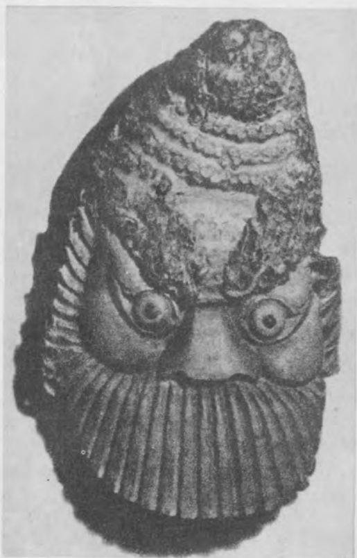
An Old Man (bamboo-root sculpture).